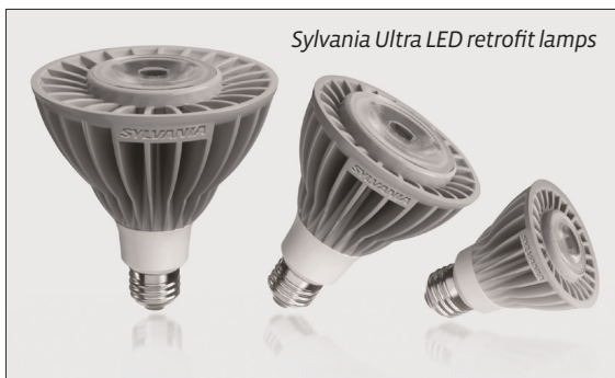
Sylvania Ultra LED retrofit lamps

The industry effort to address line-voltage LED control issues is accelerated by national legislation that will begin mandatorily phasing out 100-watt incandescent lamps, with the full market removal of 75-, 60- and 40-watt versions by 2014. The initiative started in California earlier this year.