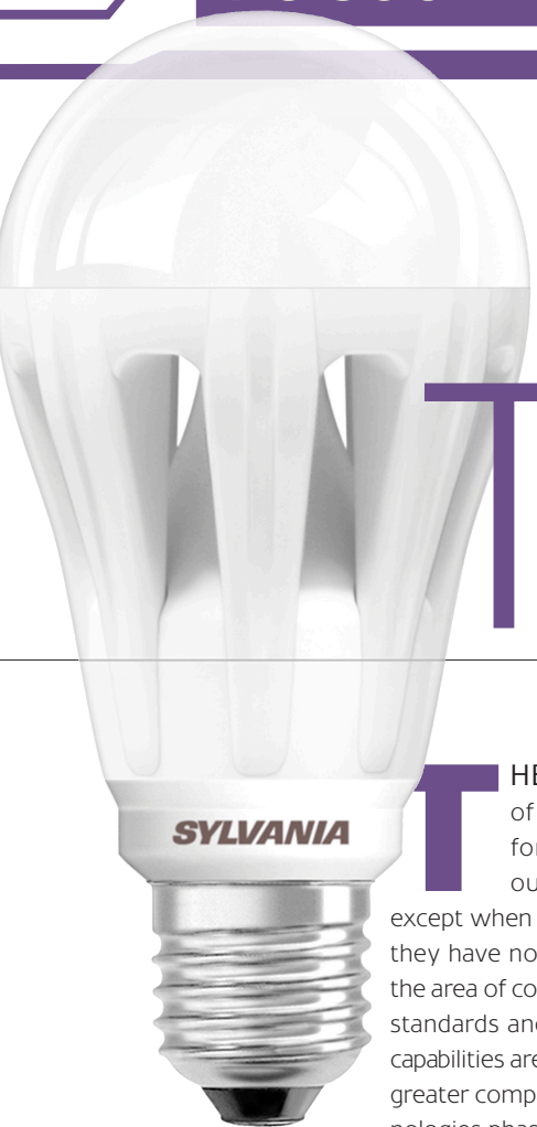
Osram Sylvania A-Line LEDs were developed to provide improved dimming functionality with traditional incandescent technologies.