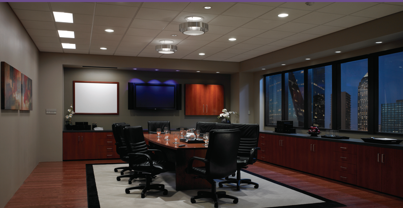
New solid-state lighting standards and expanded retrofit dimming capabilities are positioning LEDs for greater usage, such as in office-based conference rooms.

ECs must consider the control technology—the signal and wiring between the control on the wall and the fixture or lamp—when retrofitting LEDs to work with incandescent dimmers.