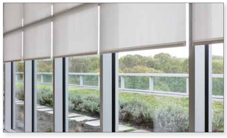
Standard IHA - keeps shades aligned

Standard IHA: All Lutron shades are pre-calibrated to run at the same drive speed before leaving the factory. In most installations shades will be aligned within 1/8".