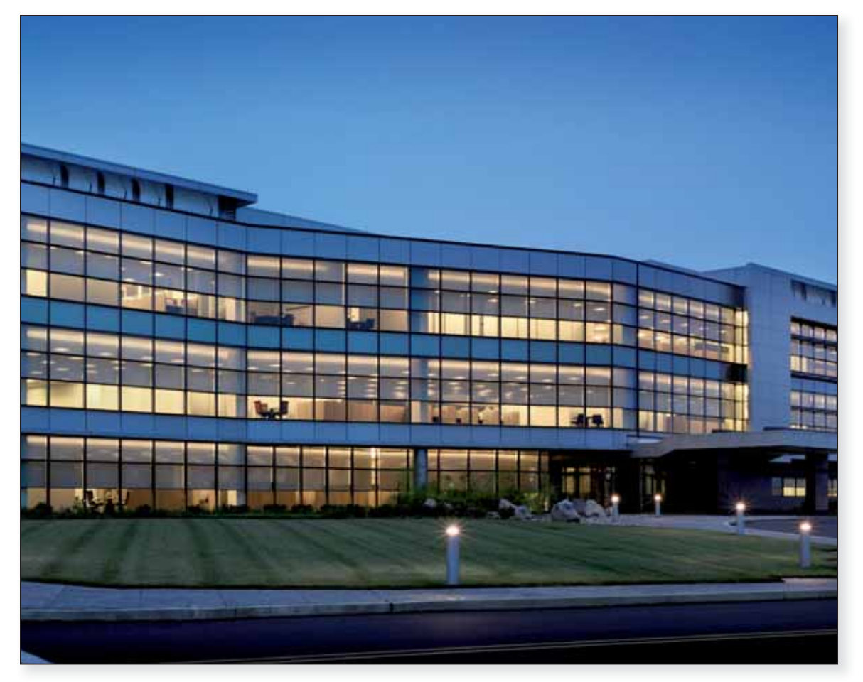
The importance of IHA - aligned shades create clean lines

IHA is the most advanced system for controlling shade movement and maintaining hembar alignment that is currently available. It is just one of the features that makes Lutron shades the most precise and most customizable shading system in the world.