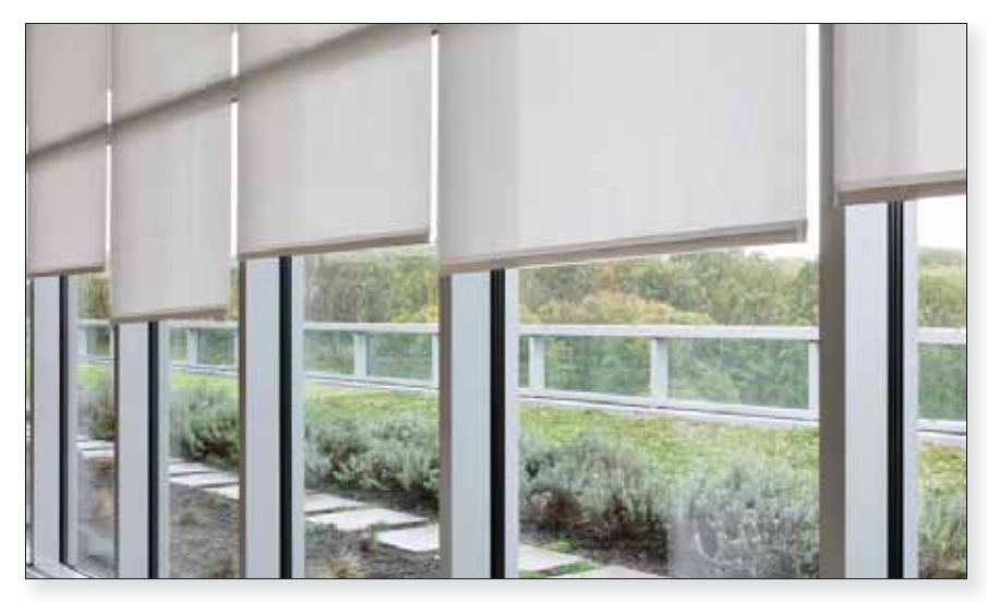
Industry standard - shades misalign over time