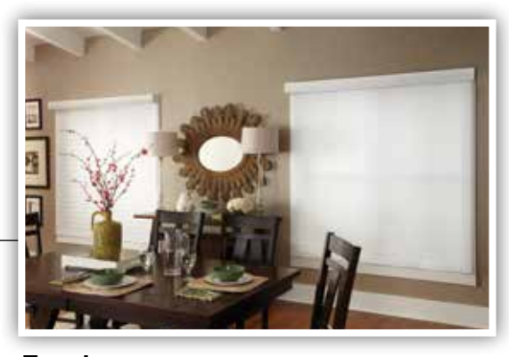
Evening Relax in comfort. Blinds lower and vanes close to minimize the amount of light in the room and to provide privacy.