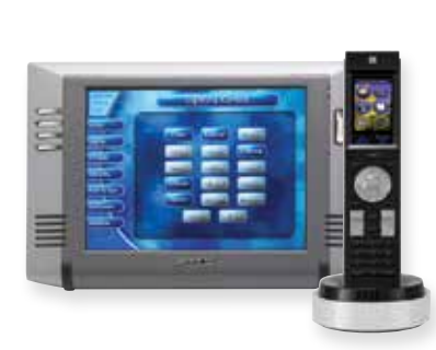
Third-party integration Shade control (as well as lights) can be integrated with other manufacturer's systems, such as audio/visual, for another level of control.

Mount it on a wall, on a tabletop pedestal, or simply leave it freestanding to use as a hand-held control.