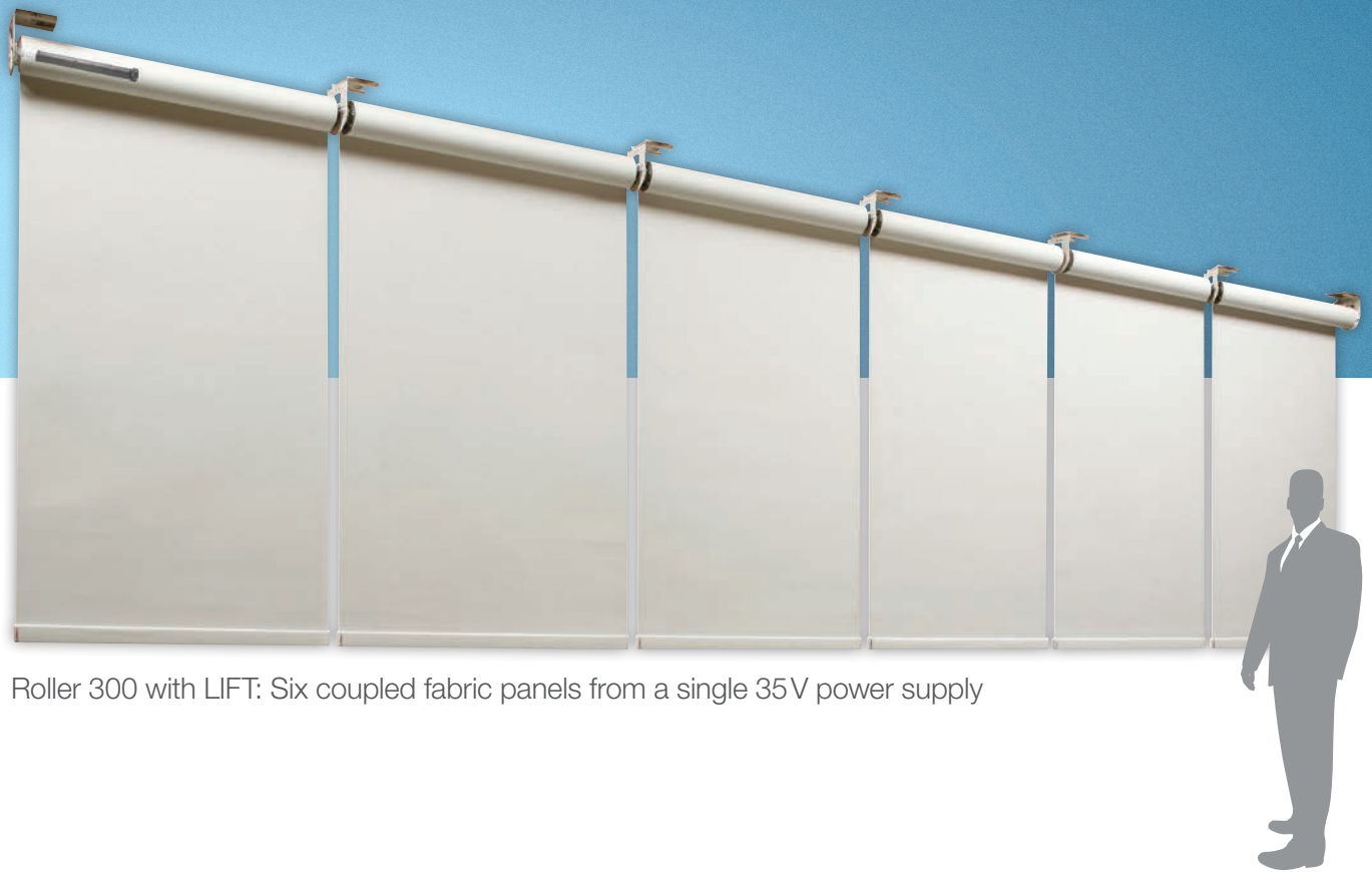
Roller 300 with LIFT: Six coupled fabric panels from a single 35V power supply

Control an entire bay of shades, all on one drive