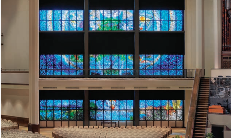
Scene 3—sheers and partial blackout