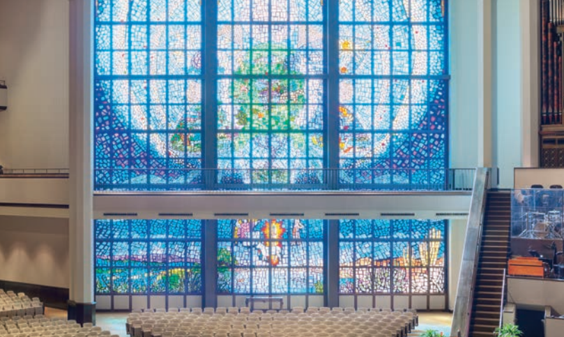
Scene 1—shade fully open