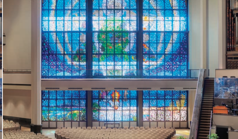
Scene 2—partial sheers