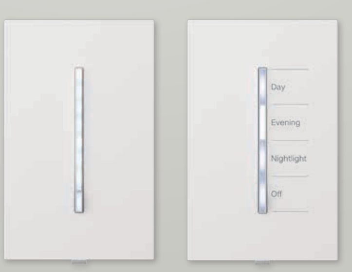
GRAFIK T dimmer and keypad No knobs, sliders, or buttons, just touch

Buttons and faceplates are made from the same material for a coordinated look