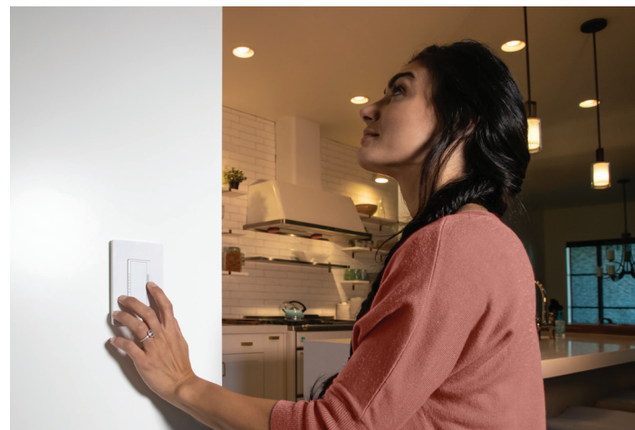
LEDs glow softly – easily locate dimmer in the dark