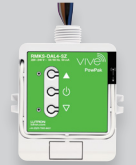
Wireless load controls