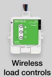
Wireless load controls