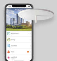
Optional facilities software