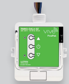
Wireless load controls