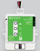
Wireless Load Controls