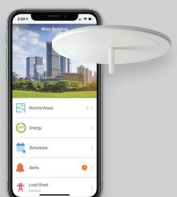
Optional Facilities Software