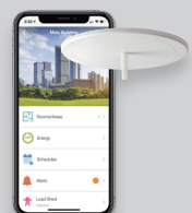
Optional facilities software