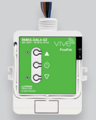
Wireless load controls