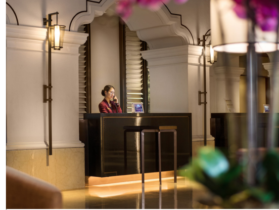
Electrical light works with natural light to illuminate the hotel lobby.

The Lutron centralized lighting control system is also used to control the lighting of the mezzanine in the second-floor public area in the hotel. The hallways and the public areas on the second floor usually have less traffic than the ground-floor lobby, and lights do not need to be on at full strength, especially in the later hours.