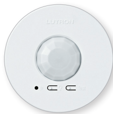
Radio Powr Savr wireless ceiling-mount occupancy sensor