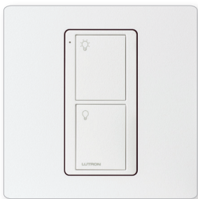
Pico wireless switch