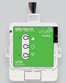
Wireless load controls