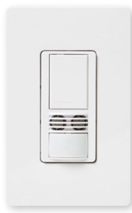
Maestro in-wall dual-tech sensor MS-A102

Maestro in-wall sensor switches and dimmers are available in many voltages and amperages.