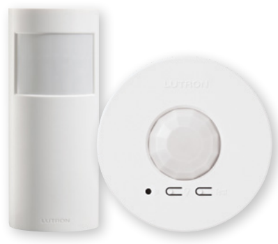
Wall/ceiling mounted sensors LRF2-OWLB-P-WH; LRF2-OCR2B-P-WH

Perfect for restrooms, hallways, cafeterias, and more.