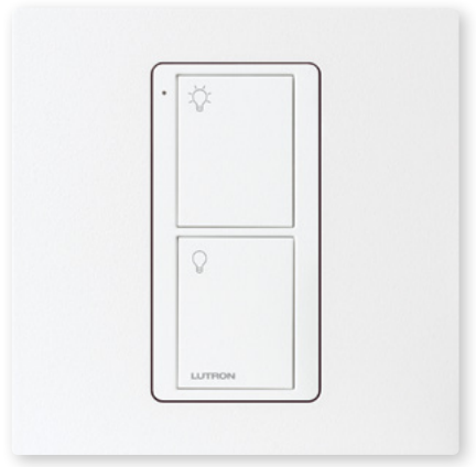
Pico wall mounted wireless remote (in a wallplate) LPFP-S1-TXX

Perfect for small spaces such as private offices, equipment rooms, and more.