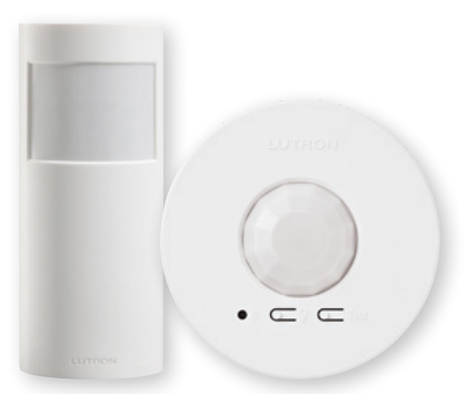
Wall/ceiling mounted sensors LRF3-OWLB-P-WH; LRF3-OCR2B-P-WH

Perfect for toilets, corridors, kitchen areas, and more.