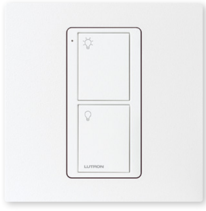
Pico 1 column wallplate LPFP-S1-TXX