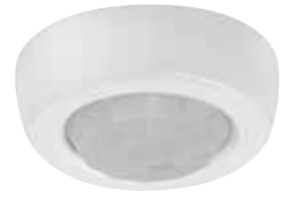
Limelight sensor modules