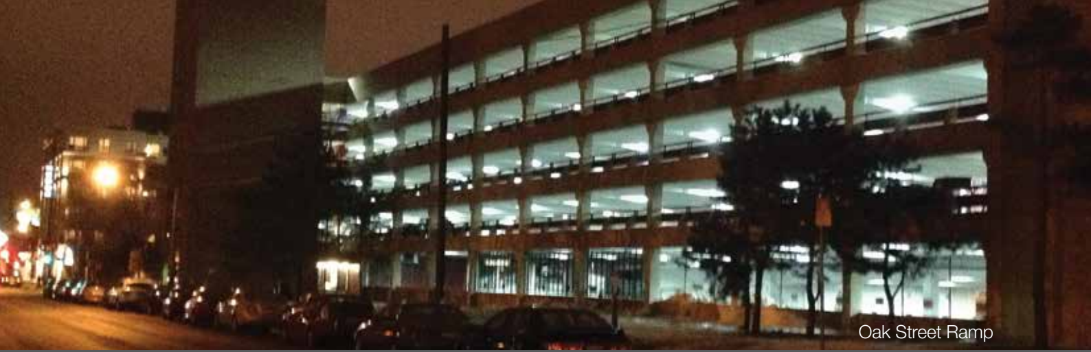
Oak Street Ramp

Limelight upgrades help save energy and improve comfort in the parking facilities.