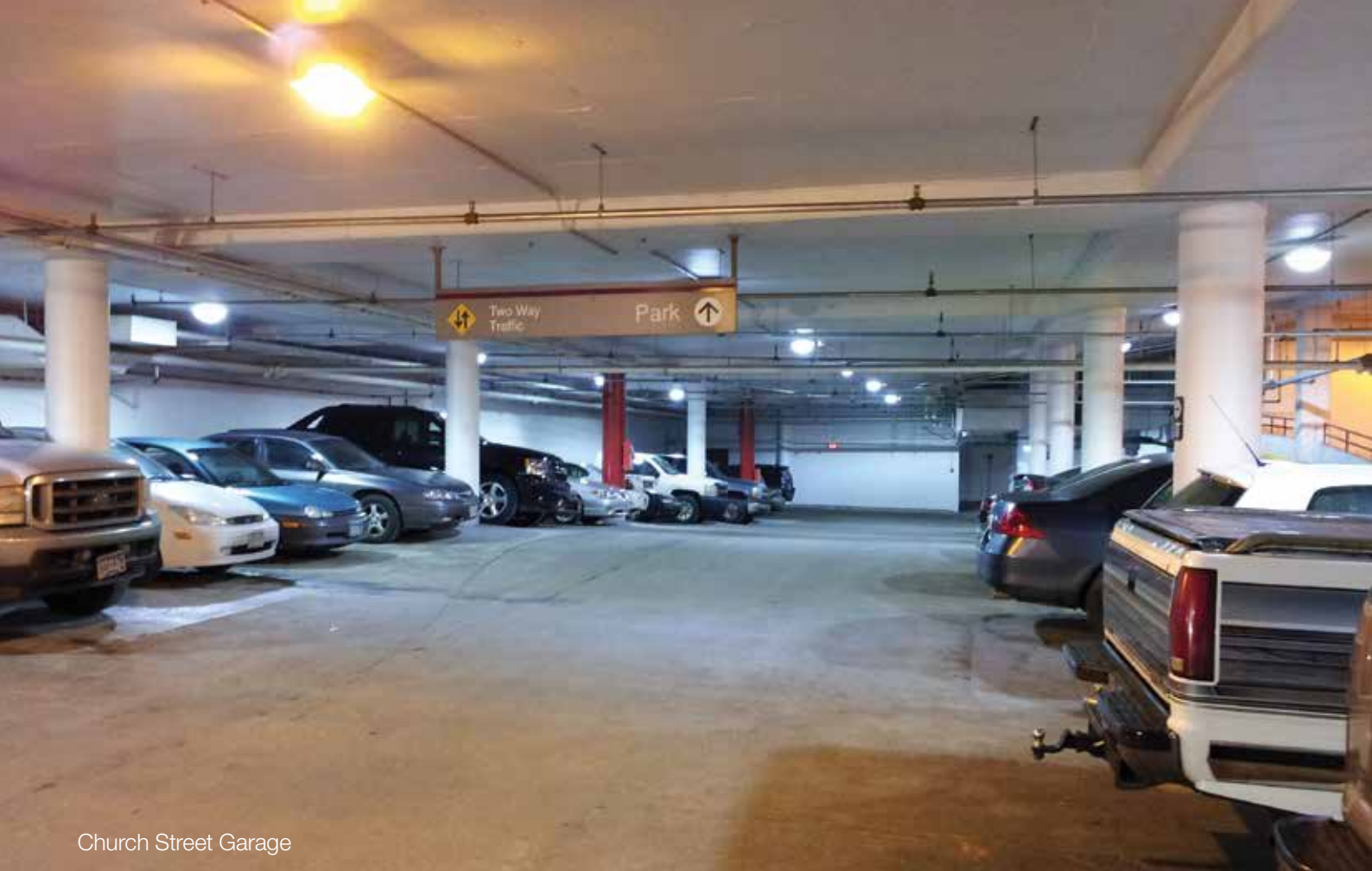
Church Street Garage

Parking and Transportation Services (PTS) is proud to help increase the University's energy efficiency.