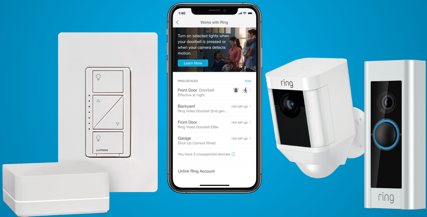
Caséta Smart Bridge & Dimmer

Peace of mind is knocking. Set lights to turn on when your Ring doorbell or camera detects motion outside.