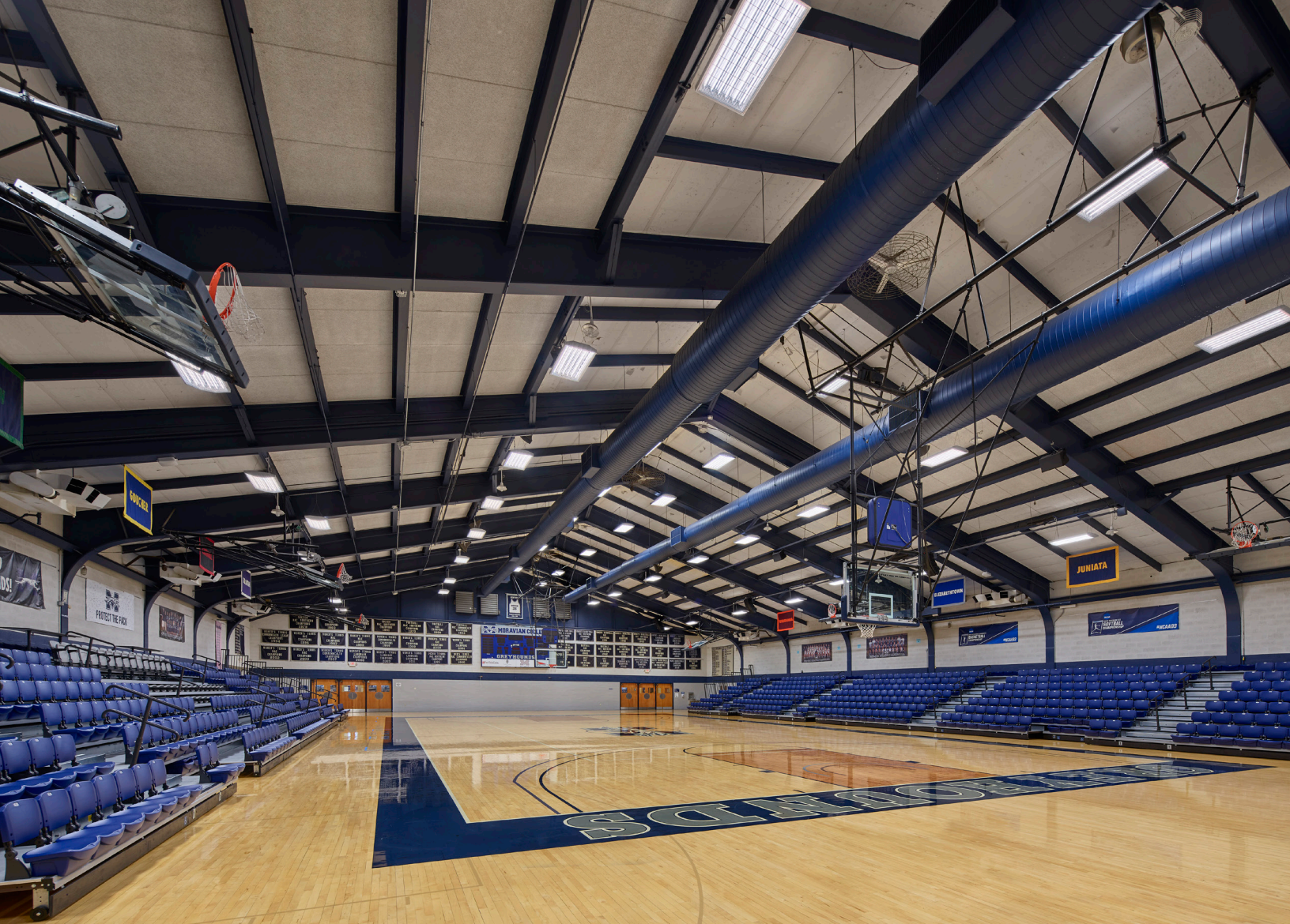
Lighting in the Moravian University competition gym can be easily adjusted to meet the needs of sports competitions, awards ceremonies, and other public events.