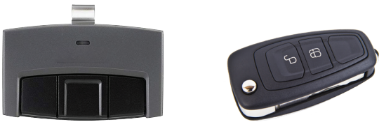
Typical devices found in FCC 15.231.