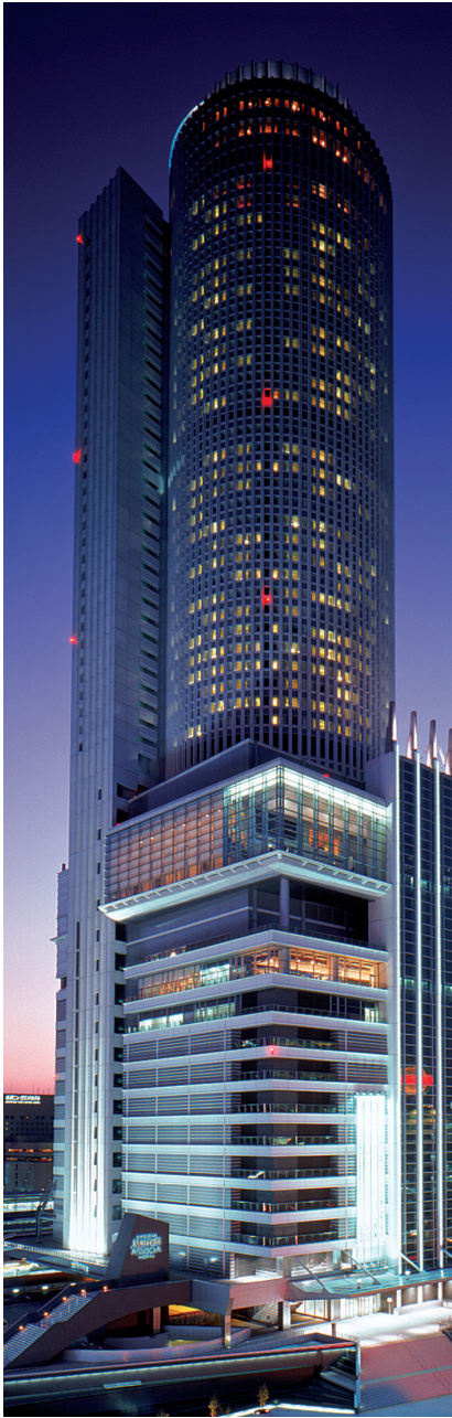
Lutron's Clear Connect Technology is ultra-reliable and performs flawlessly even in high-density installations.