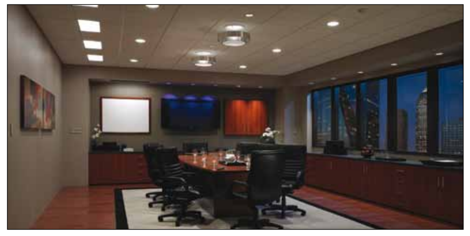
The right combination of LED fixtures and controls brings energy savings and flexibility to commercial applications.

• Forward Phase Control: Typically used for incandescent and MLV (magnetic low voltage) light sources, this is the most common control method. There are more than 100 million forward phase control dimmers installed, and it is likely that many of these will end up controlling LED replacement lamps. This is also a great retrofit solution because it does not require a neutral wire in the