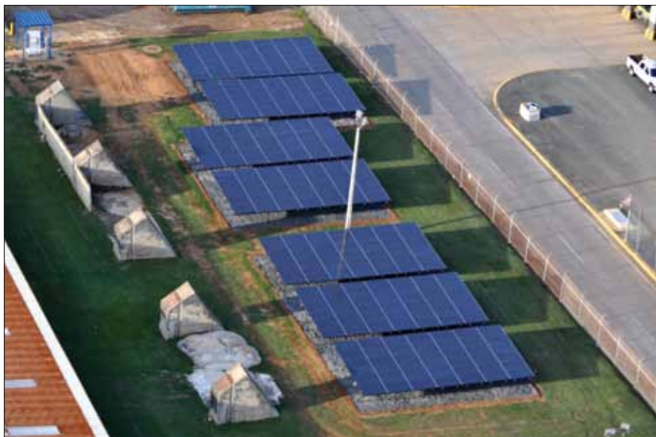
The service recently installed solar panels at Air Station Borinquen.