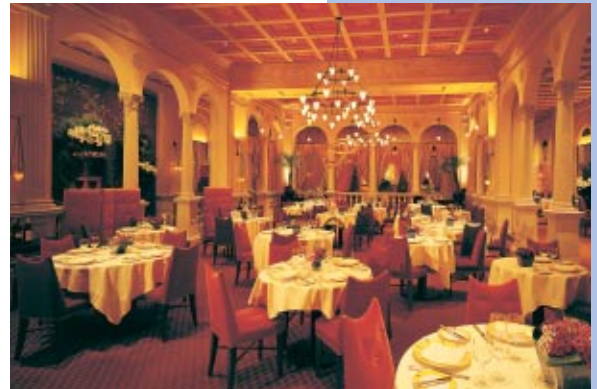
Scene 2: Lunch