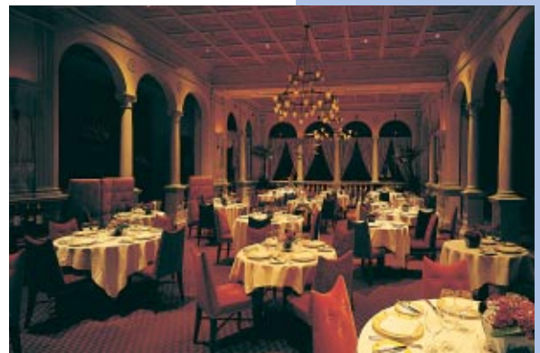
Scene 4: Intimate Dining