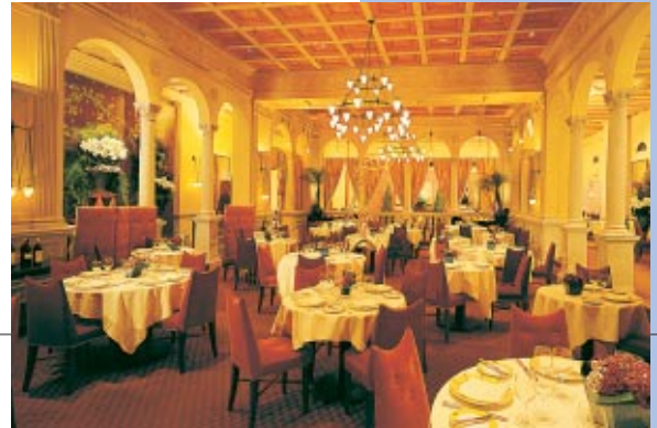
Scene 1: Clean and Reset

In addition to the main dining room, GRAFIK Eye 4000 Systems were used in the entrance lobby and the bar, and other local controls were used in the corridors, the lounges, the niches and the kitchen. Boulud has redefined fine dining by paying attention to every detail. The excellent cuisine, personalized service and elegant atmosphere continue to make Daniel a destination restaurant.