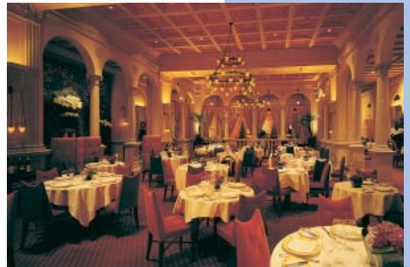
Scene 3: Evening