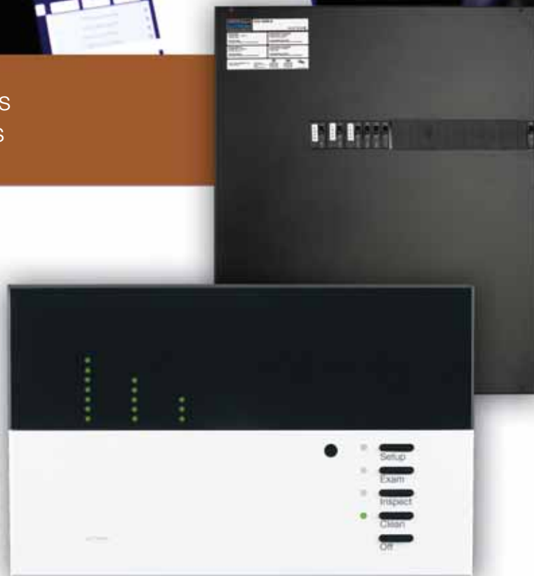
GRAFIK Eye preset lighting control unit and DC dimming panel