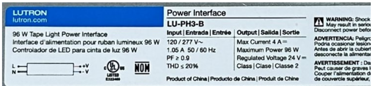
Close up of product label on recalled Lutron Power Interface