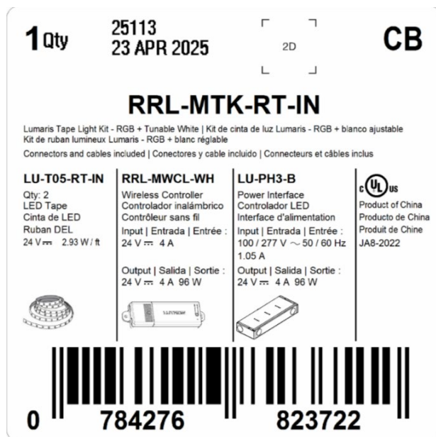
RadioRA 3 LED tape light starter kit package label lists the recalled power interface