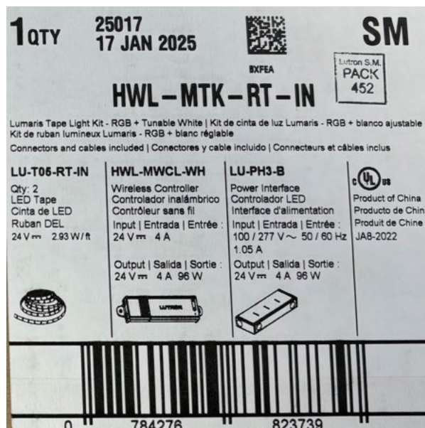
HomeWorks LED tape light starter kit package label lists the recalled power interface