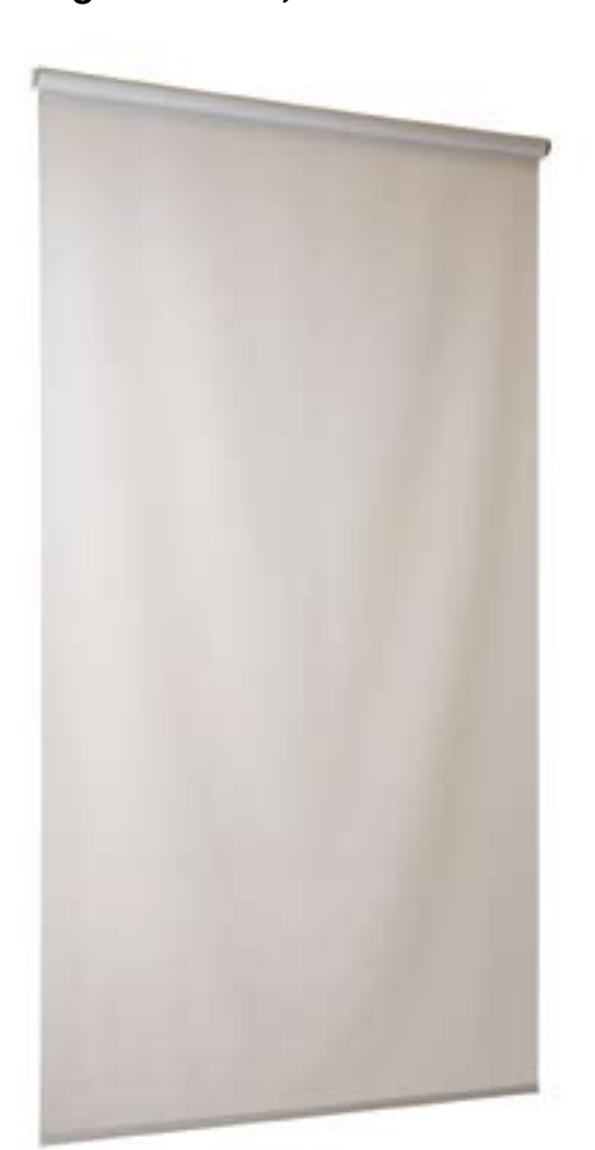
Figure 1 - Tall, Narrow Shade