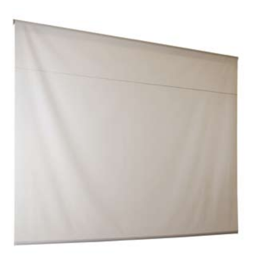
Figure 7 - Same shade with reduced deflection and a batten