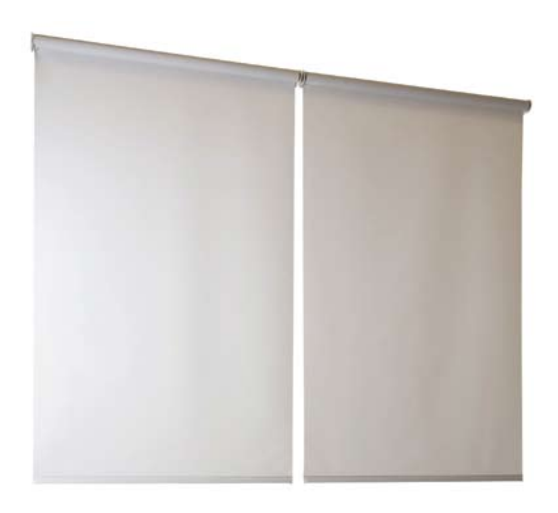
Figure 5 - Wide Shade Split Into Two Narrower Shades