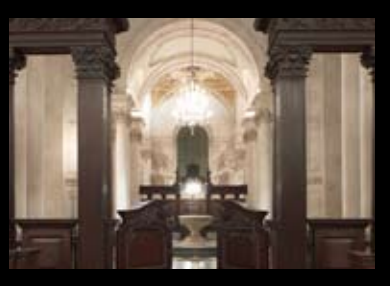
Offering users a simple graphical user interface