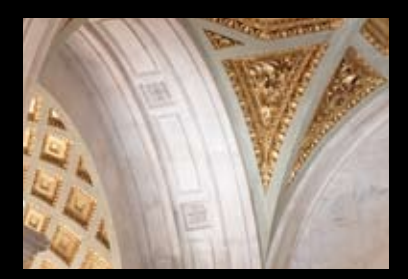
Capacity to offer control of multiple zones, separated into distinct areas