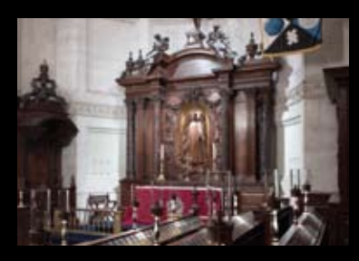
Ability to use RF systems for wireless control