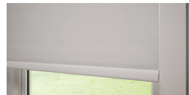
Haven Blackout in White

Pricing starts at $599 for shades up to 48" x 80". Shades are available in configurations up to 108" x 120" and can be mounted one of three ways — inside, outside on the window frame, or outside above the window frame.